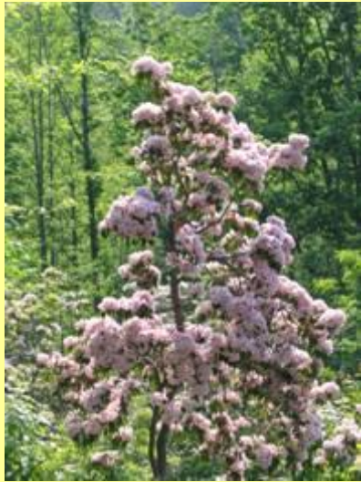
MTN LAUREL IN THE SANCTUARY