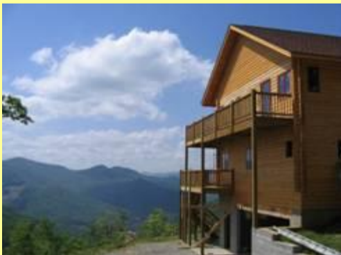
NEW HOME UNDER CONSTRUCTION IN THE SANCTUARY MTN GROVE