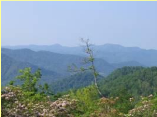
VIEWS FROM THE SANCTUARY AT MTN GROVE.