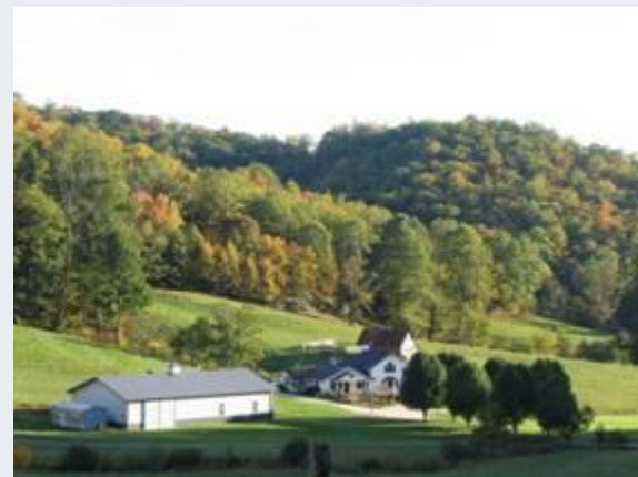
THE RYAN FARM IN MOUNTAIN GROVE