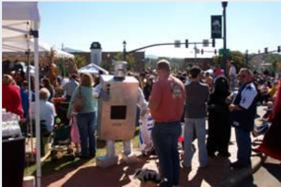
AT THE PUMPKIN ROLL – FRANKLIN'S FALL FESTIVAL