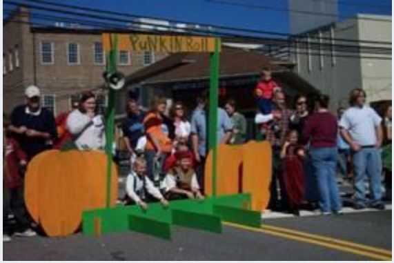
AT THE PUMPKIN ROLL – FRANKLIN'S FALL FESTIVAL

With the leaf season in full swing in October, I was happy to see some of you back for a week or a long weekend. I have given many tours of our Mountain Grove community thus far this fall despite the messiness of our State Road construction. By the spring, our new road will be complete past our property. Then it will move on to connect Franklin and Sylva