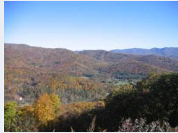
FALL IN THE MOUNTAINS