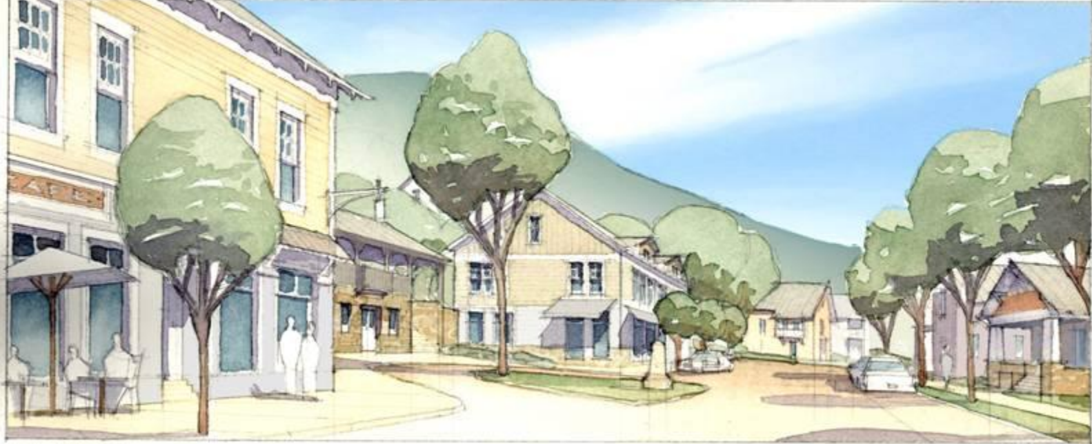
Market Street – The Sanctuary Village