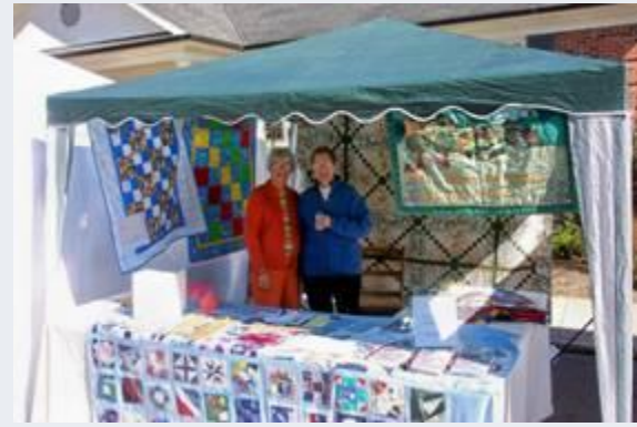
AT THE PUMPKIN ROLL – FRANKLIN'S FALL FESTIVAL